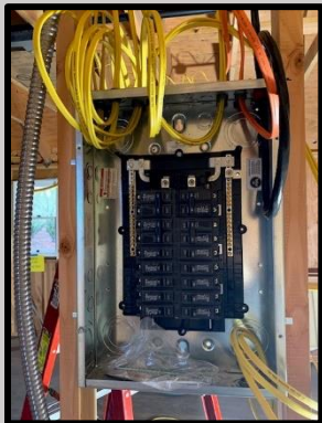
New Electrical Panel in storage room

Update: As we write this, the electricians are on site completing the electrical work.